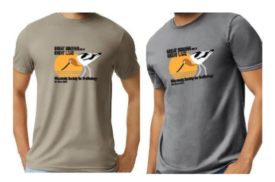
Silent auction (cash and checks only; no credit/debit cards)

T-shirts are available only by pre-order . Pick up your shirts at the convention check-in table on Friday or Saturday. Extra cost for shipping may apply if an order is not picked up at the convention.